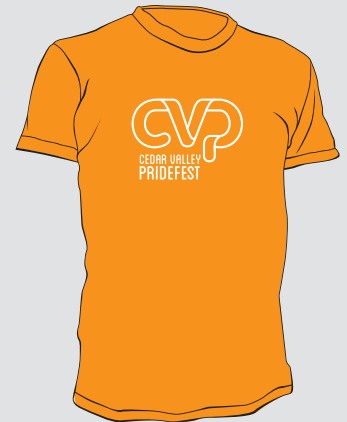
2012 Cedar Valley Pridefest t-shirts sold quickly for $15 each!

You can help sponsor CVP personally, too.